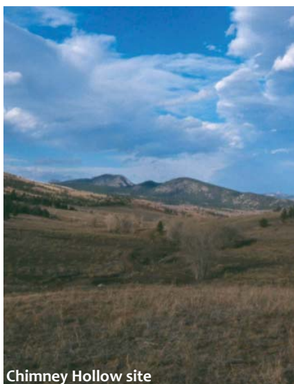
Chimney Hollow site

Several years ago, the Municipal Subdistrict started looking at ways to improve the reliability of Windy Gap water. After extensive review, the Municipal Subdistrict determined that the best solution was to construct Chimney Hollow Reservoir on the East Slope.